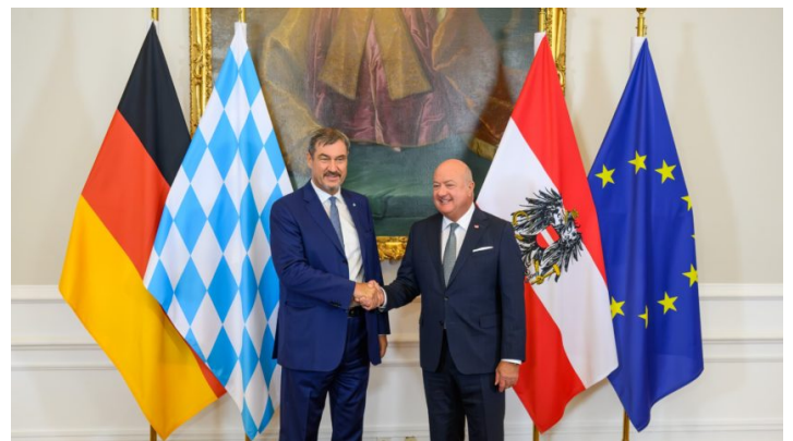
On 15 July 2025, Minister-President Dr Markus Söder chaired the meeting of the Council of Ministers on the