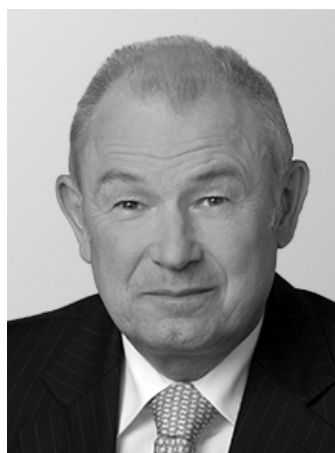
Dr. Günther Beckstein