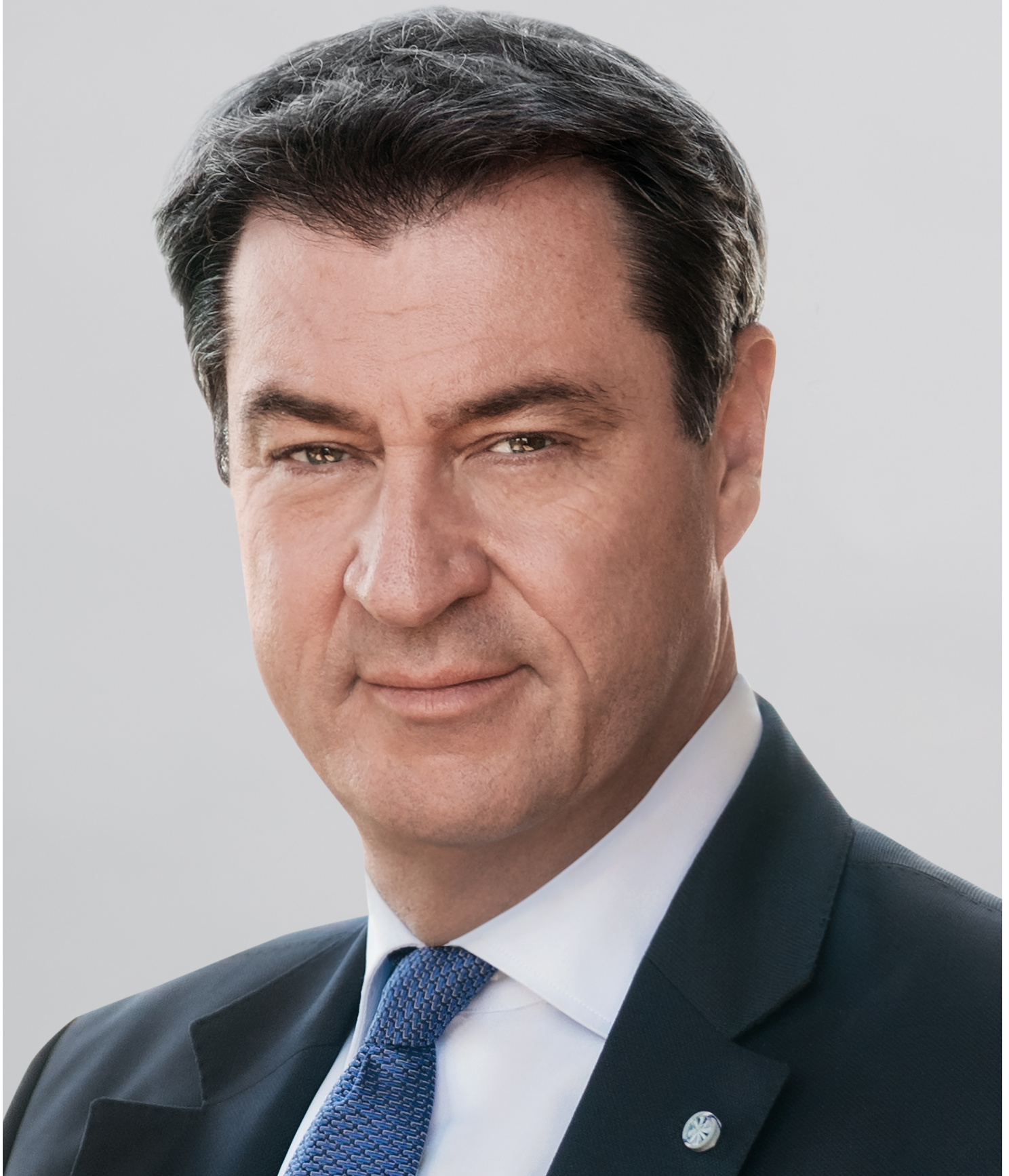
Portrait: Dr. Markus Söder, MdL

Born on 5 January 1967 in Nuremberg, married, four children