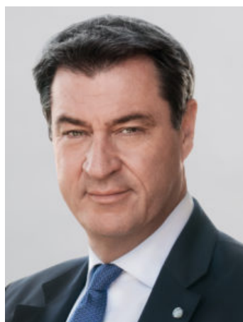
Dr. Markus Söder, MdL