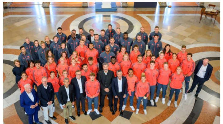
On 10 September 2025, Minister-President Dr Markus Söder welcomed the FC Bayern Munich women's and men's football teams to the dome hall of the Bavarian State Chancellery.