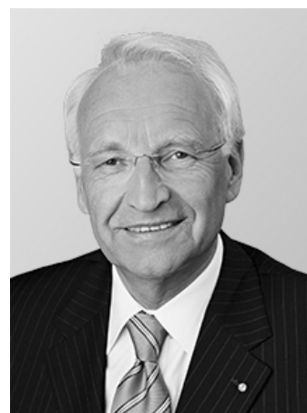
Dr. Edmund Stoiber