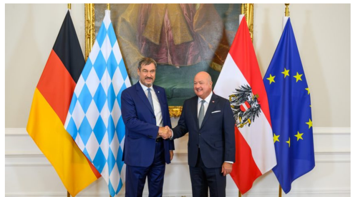
On 15 July 2025, Minister-President Dr Markus Söder chaired the meeting of the Council of Ministers on the