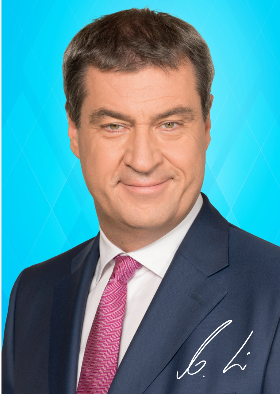
Dr. MARKUS SÖDER, MdL Bavarian Minister-President