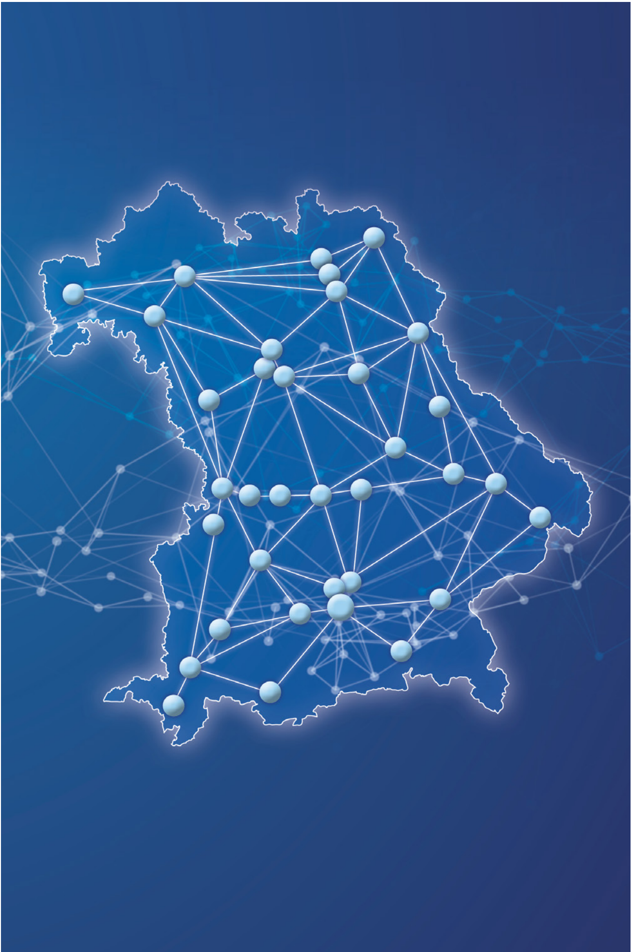
Providing for the future through interconnection: The entire state will benefit from our Hightech Agenda Bavaria.